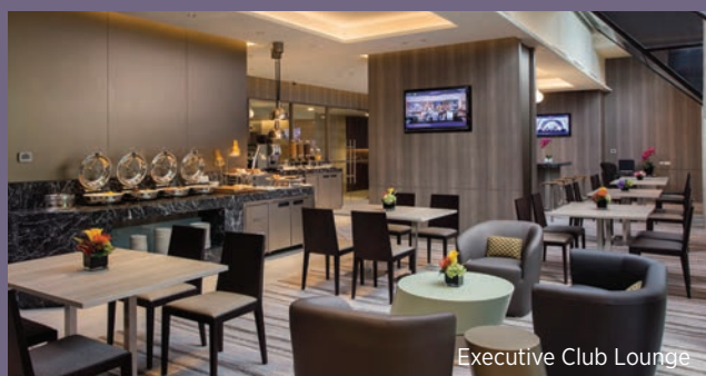
Executive Club Lounge

Executive Club Lounge opens from 6pm to 8pm daily. Premier Club Lounge opens from 7am to 10pm daily.