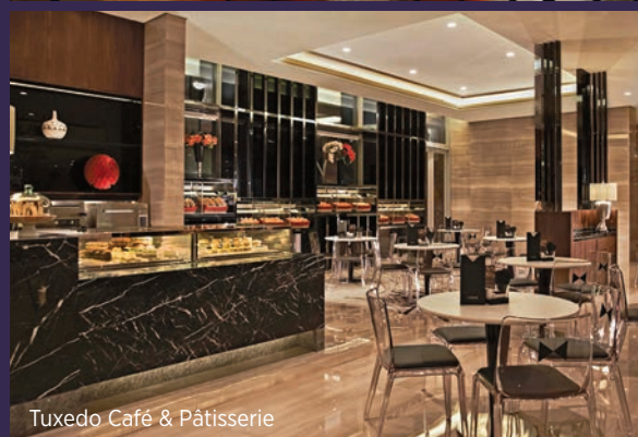
Tuxedo Café & Pâtisserie