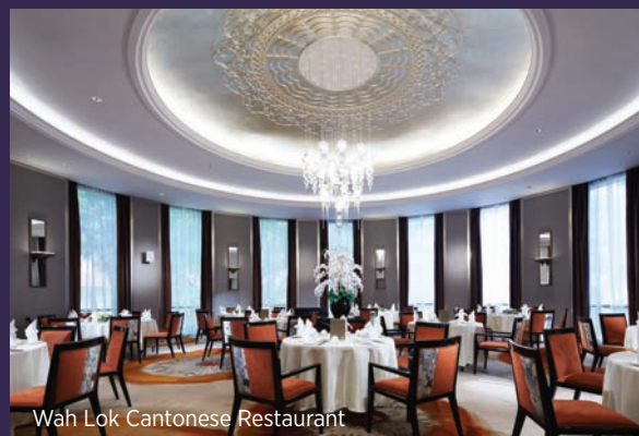
Wah Lok Cantonese Restaurant