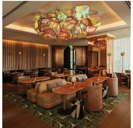
Ferrari Legs (2022) by Tyler Shields Chromogenic print on paper Location: Rooftop