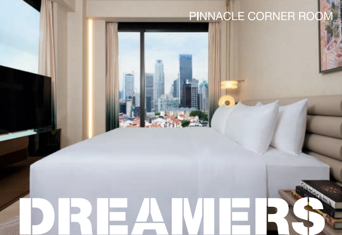
PINNACLE CORNER ROOM