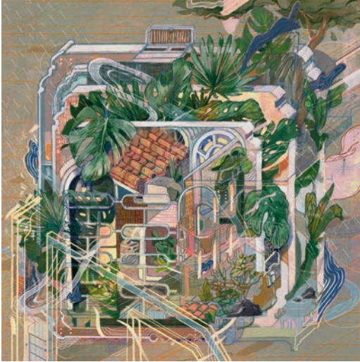
Rojak (2021) by André Wee Print on wood Location: hotel rooms

The international placements of each artwork across the hotel's dynamic space makes for a storied viewing experience as guests journey through the property, with elements of discovery and surprise at every turn.